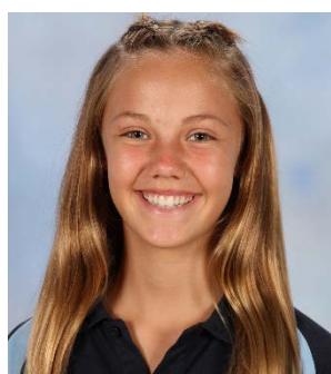
Above and opposite: Gold Medallion Recipients.