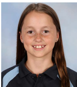
Followed by: Silver and Bronze Medallion Recipients